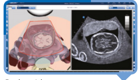
Fetal cranial anatomy