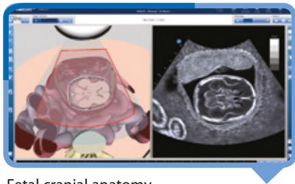
Fetal cranial anatomy