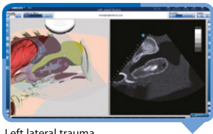
Left lateral trauma