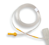
Oridion Filterline H 8300-0521-01 (Ad/Ped, Set of 25) 8300-0522-01 (Inf/Neo, Set of 25)