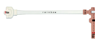
R1-20L Infant Adhesive Sensors 8000-001463 SpHb, SpMet, SpO 2 (Box of 10)