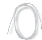
YSI Single-Use Adult Esophageal Rectal Probe 8000-0672

ZOLL offers single-use temperature probes for use in different clinical applications