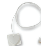
YSI Single-Use Adult Skin Temperature Probe 8000-0673