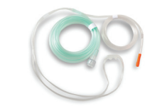
Oridion Smart CAPNO line Plus O 2 8300-0524-01 (Adult, Case of 25) 8300-0525-01 (Pediatric, Case of 25)