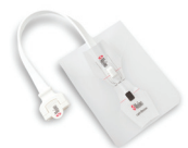
Rainbow Single-Use Sensors 8000-0336 (Patients > 30kg) 8000-0339 (Patients 10-50kg)

(For use with 8000-0331 or 8000-0330 reusable patient cable)