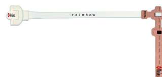
R1-25L Adult Adhesive Sensors 8000-000462 SpHb, SpMet, SpO 2 (Box of 10)