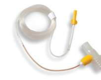
Oridion Vitaline H Set Adult/Pediatric 8300-0523-01 (Case of 25)