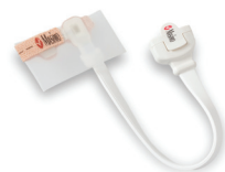
Rainbow Single-Use Sensors 8000-0337 (Patients < 3kg, > 30 kg) 8000-0340 (Infant Patients 3-30kg)