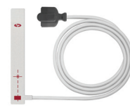
M-LNCS Neonatal Preterm Adhesive Sensor 8000-000478 (NeoPt-3 Neo, Box of 20)