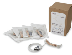
M-LNCS Inf-3 Adhesive Sensor 8000-000477 (Infant, Box of 20)