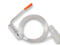
Oridion Filderline Set Adult/Pediatric 8300-0520-01 (Case of 25)